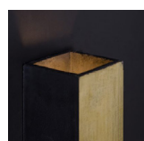
Optional Brass finish