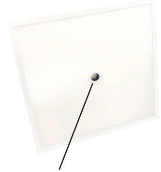
Smart Edge night/security downlight

The Smart Edge LED is also available with an independent switchable night/security IP rated downlight. It is ideal for hospitals and care homes, where observation of patients is required as well as in office buildings for security. The Smart Edge Night/Security LED offers both visual comfort and functionality.