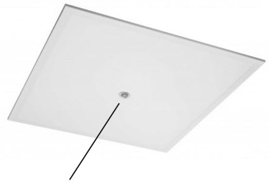
Smart Edge LED DALI PIR

Two sensor options are available depending on the level of adjustability required: DALI PIR or Standard PIR.